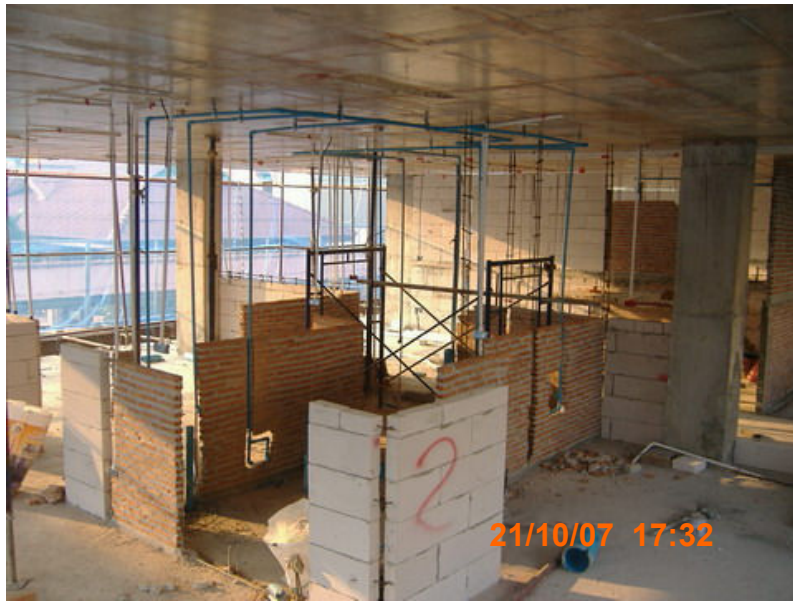
M&E WORKS BEFORE BLOCK & BRICK WORK LEVEL 2 nd