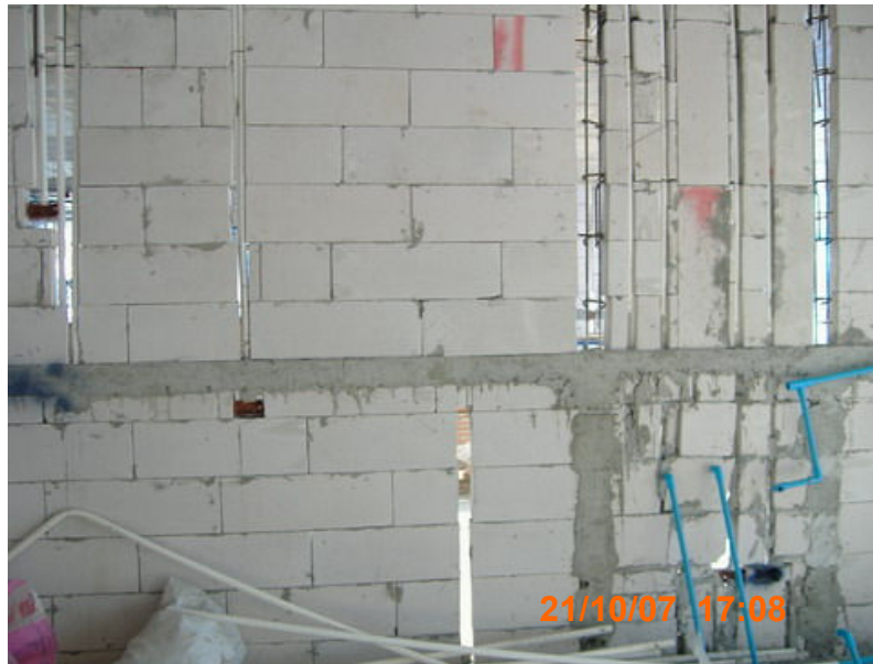
BRICK & BLOCK WORKS LEVEL 2 nd