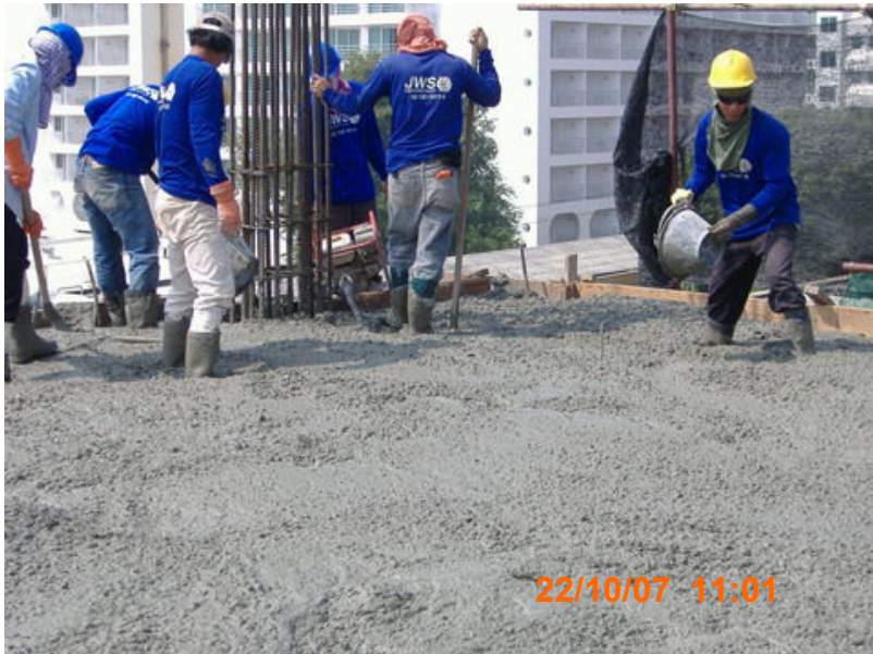
POURING CONCRETE LEVEL 6 th