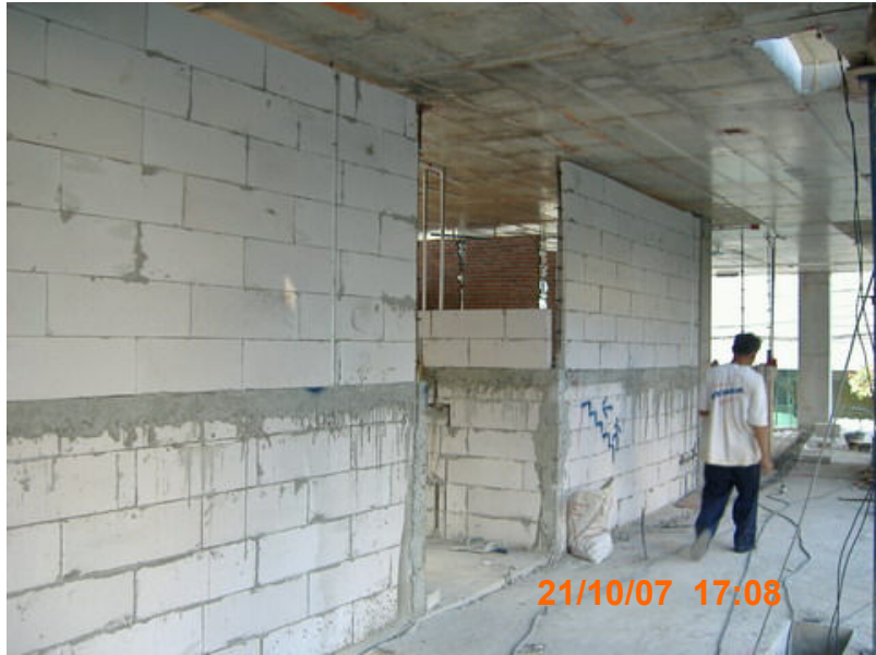
BLICK & BLOCK WORKS LEVEL 3 rd