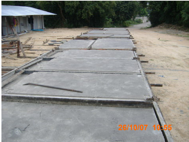
POURING CONCRETE PRECAST WALL