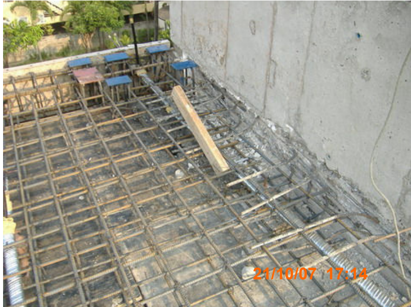
PLATE FOR PRECAST LEVEL 6 th