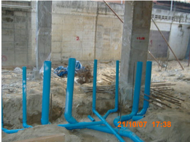
INSTALLATION SANITARY SYSTEM LEVEL GROUND FLOOR