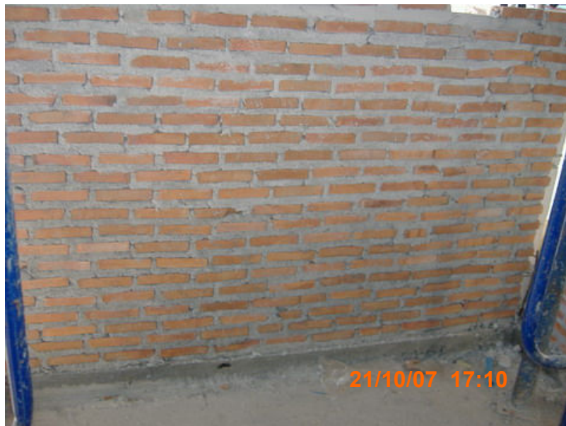
INSTALLATION CURB & BLOCK WORKS LEVEL 2 nd