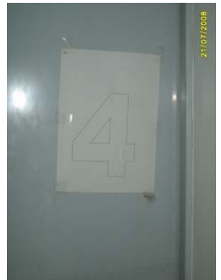
Pict No.60 : 4th Floor