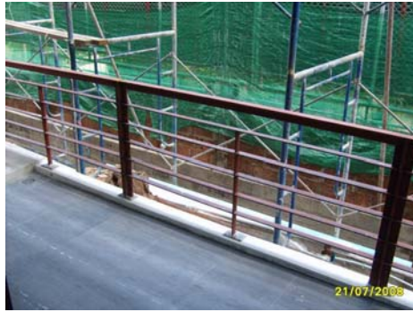
Pict No.33 : Balcony Hand railing installation