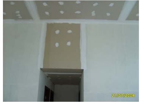
Pict No.111 : Ceiling plastering works