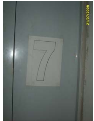
Pict No.105 : 7th Floor