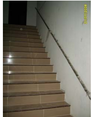
Pict No.81 : Stair to 6th Floor