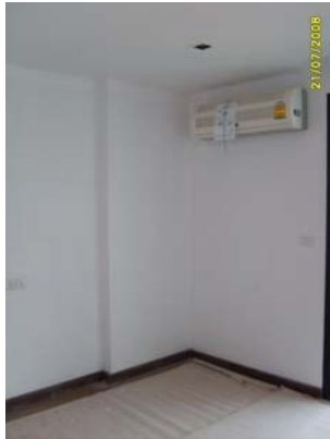
Pict No.77 : Master Bedroom