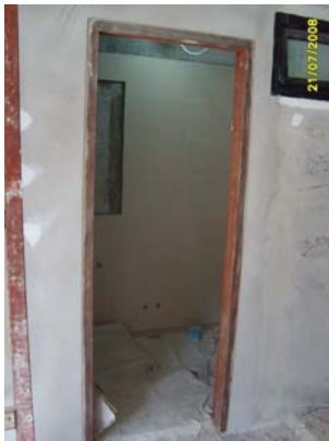
Pict No.16 : Door frame and 1st Toilet