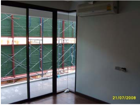
Pict No.49 : Master bedroom general view