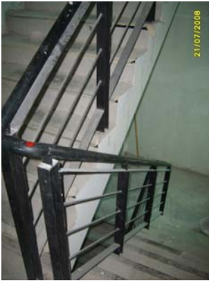
Pict No.160 : Handrailing to 4th floor