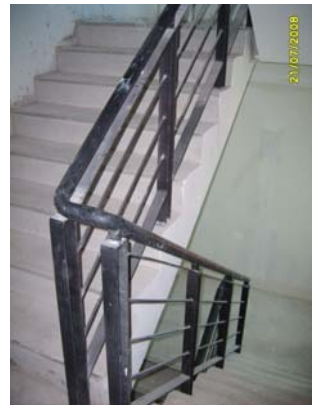
Pict No.156 : Handrailing works to 6th floor