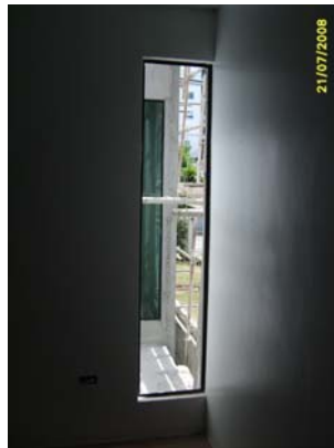
Pict No.41 : WG1 Fixed windows beside Janitor room