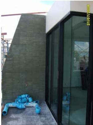
Pict No.139 : Balcony view