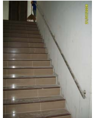
Pict No.114 : Stair to 8th floor