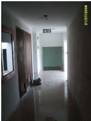
Pict No.127 : Corridor General view