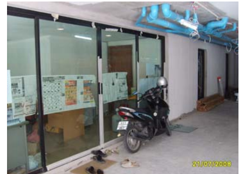
Pict No.09 : Aluminium sliding door and Contractor office