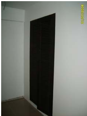
Pict No.35 : Water pipe shaft door