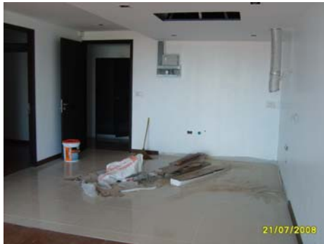
Pict No.95 : Kitchen area