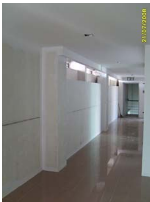
Pict No.131 : Corridor General view