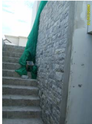
Pict No.140 : Natural stone decoration