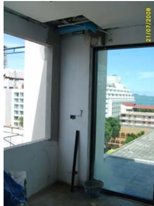
Pict No.137 : Rectify work of drainage pipe