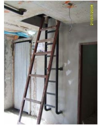
Pict No.15 : Fire exit ladder 1st-2nd floor