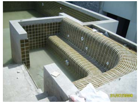
Pict No.150 : Jacuzzi Bench tiling works