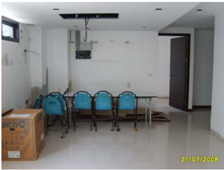
Pict No.29 : General view