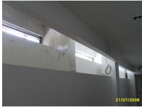
Pict No.38 : Block out for aluminium windows