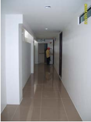
Pict No.37 : Corridor general view