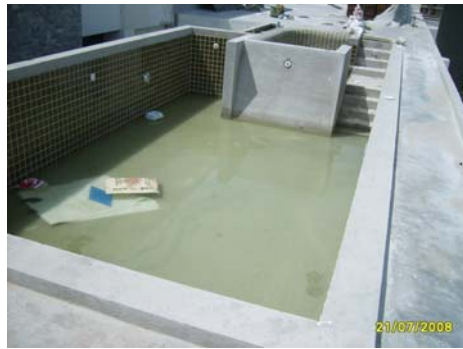
Pict No.149 : Swimming pool general view