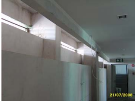
Pict No.122 : General view