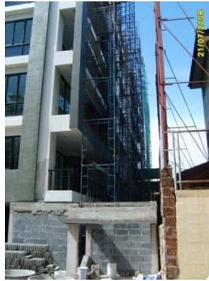
Pict No.02 : Side View