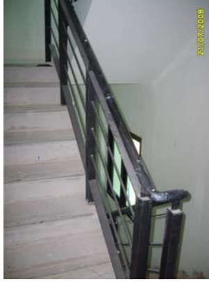
Pict No.158 : Handrailing to 6th floor