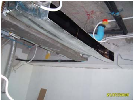
Pict No.118 : Air conditioning systems