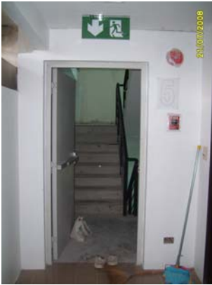
Pict No.88 : Fire exit door