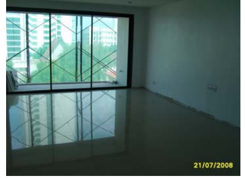
Pict No.99 : Living area general view