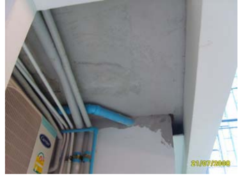
Pict No.51 : General view