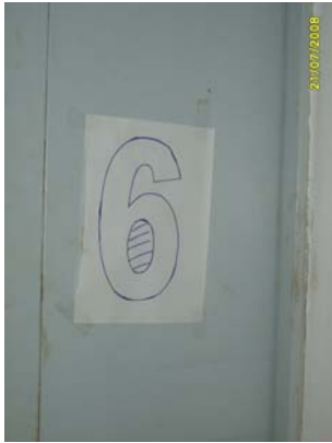
Pict No.89 : 6th Floor