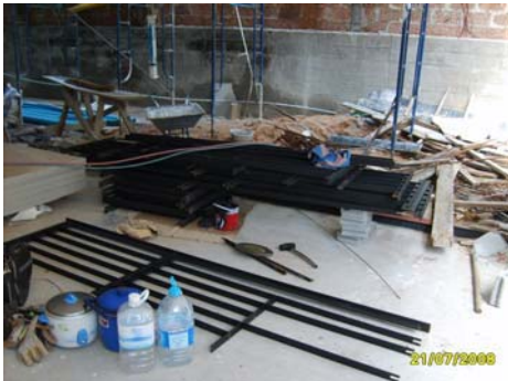
Pict No.07 : Balcony hand rail fabrication.