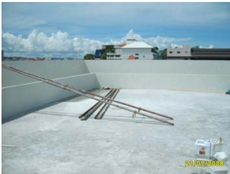
Pict No.151 : Planter box