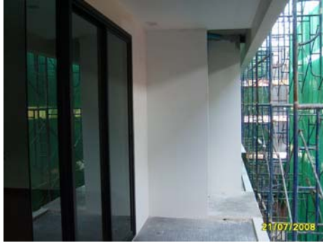
Pict No.50 : Balcony View