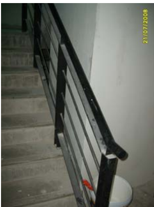
Pict No.166 : Hand railing to 3rd floor