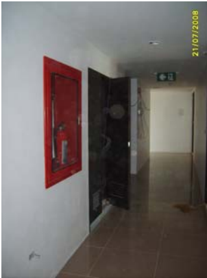
Pict No.91 : Corridor general view