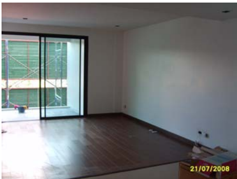
Pict No.70 : Living area general view