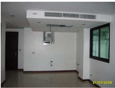
Pict No.40 : Kichen area