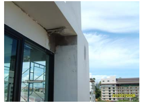
Pict No.138 : Rectify work of drainage pipe