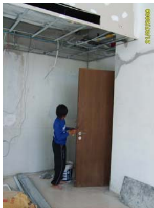
Pict No.107 : Door paint