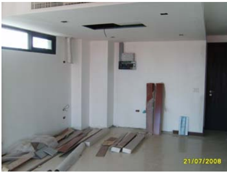
Pict No.76 : Kitchen Area general view