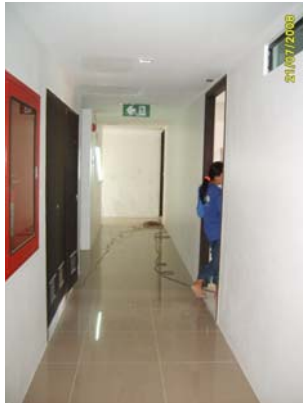
Pict No.80 : Corridor view