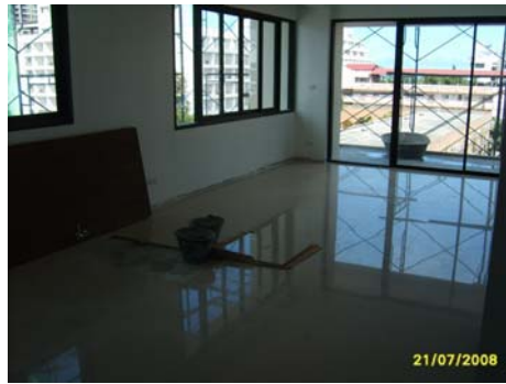
Pict No.101 : Floor tiling works for Living area