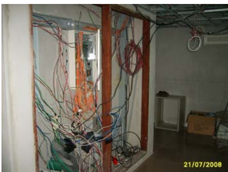
Pict No.22 : Wiring works