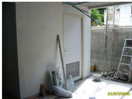
Pict No.11 : Door installation of MDB Room