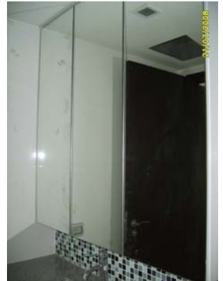
Pict No.66 : Cabinet above water sink