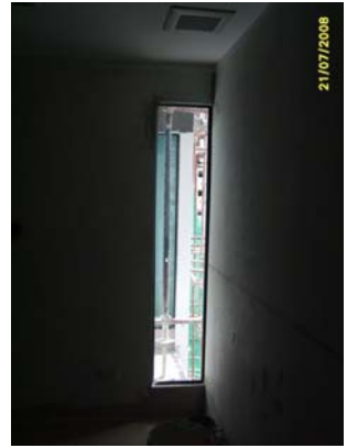
Pict No.123 : WG1 Fixed windows beside Janitor room