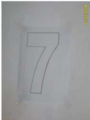
Pict No.155 : 7th Floor