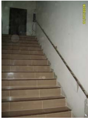
Pict No.90 : Stair to 7th Floor