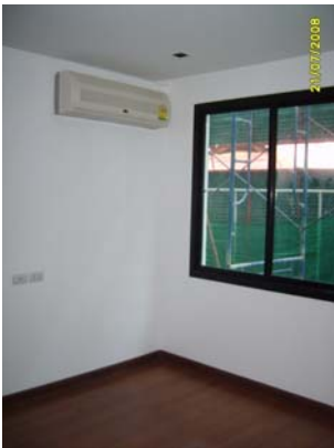
Pict No.34 : Master bedroom general view