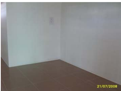
Pict No.130 : General view