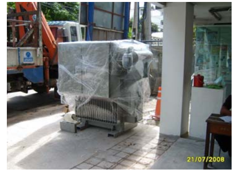
Pict No.06 : Transformer