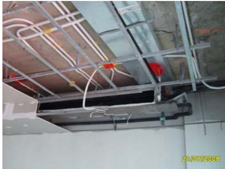
Pict No.116 : Ceiling frame works