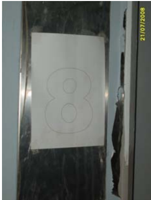
Pict No.124 : 8th Floor