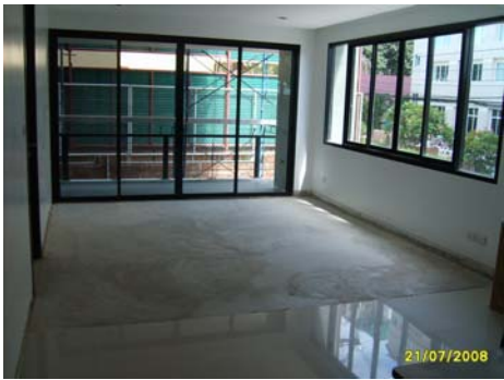
Pict No.28 : Surface preparation works for Unit 201