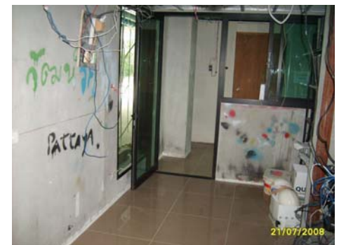
Pict No.21 : 1st Office view