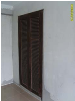
Pict No.128 : Water pipe shaft door