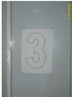
Pict No.44 : 3rd Floor