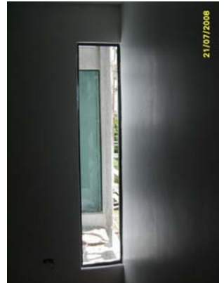
Pict No.54 : WG1 Fixed windows beside Janitor room