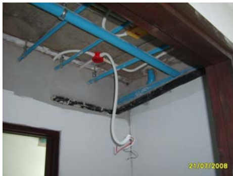
Pict No.71 : Piping works above janitor room