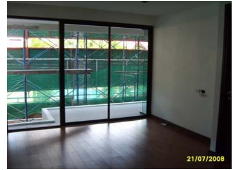
Pict No.39 : Living area general view