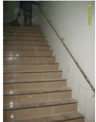
Pict No.126 : Stair to Swimming pool & Pool deck