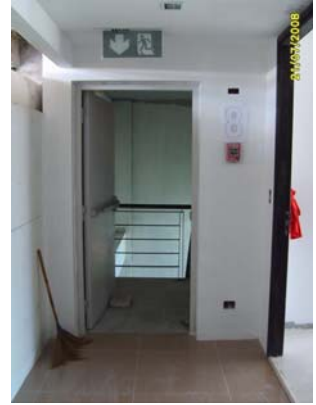
Pict No.135 : Fire exit door