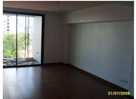
Pict No.96 : Living area general view