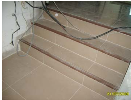
Pict No.104 : Stair to 7th Floor