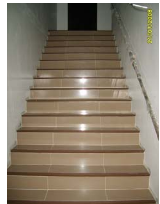
Pict No.24 : Staircase 1st to 2nd floor