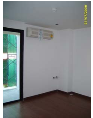
Pict No.57 : Master bedroom general view