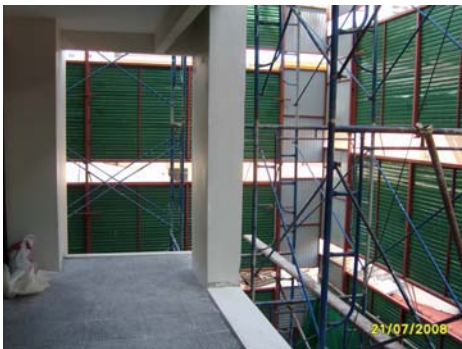
Pict No.58 : Balcony view