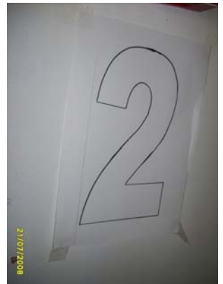
Pict No.165 : 2nd floor