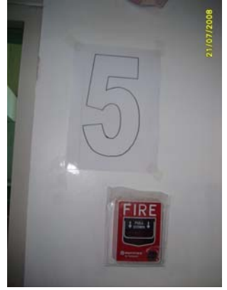
Pict No.159 : 5th floor