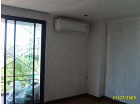
Pict No.121 : Master bedroom general view