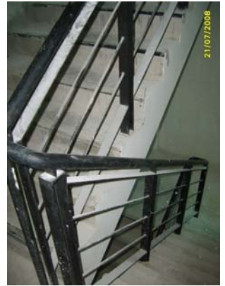
Pict No.162 : Handrailing to 3rd floor