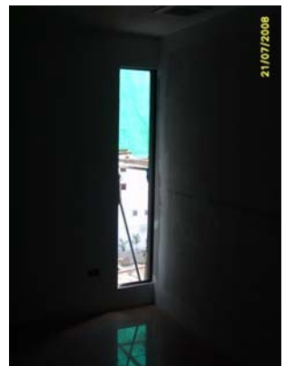
Pict No.132 : WG1 Fixed windows beside Janitor room