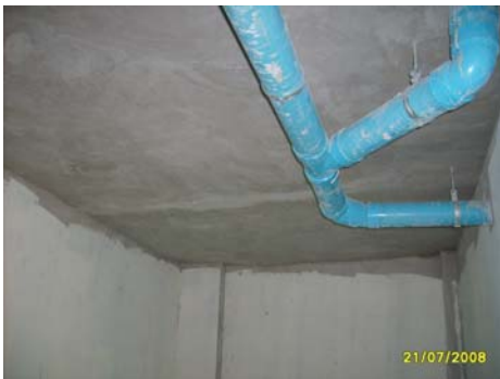
Pict No.154 : Ceiling works above fire exit area