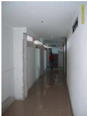
Pict No.119 : Corridor general view