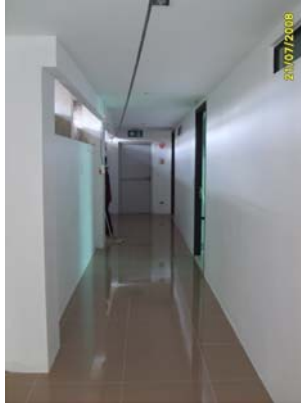
Pict No.98 : Corridor general view