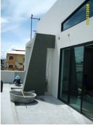
Pict No.109 : Kensai and outside works