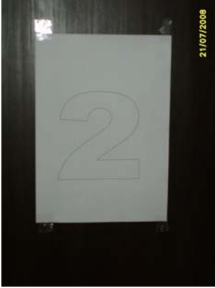
Pict No.25 : 2nd Floor