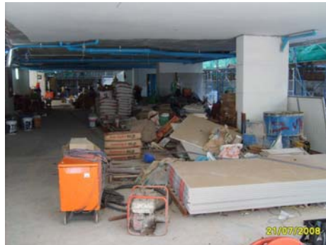
Pict No.08 : Stockyard area