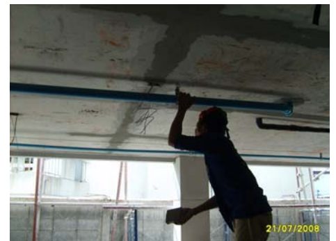
Pict No.12 : Cement plastering works