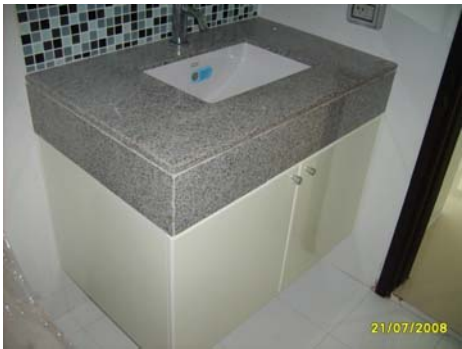
Pict No.67 : Cabinet under sink