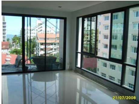
Pict No.92 : Living area general view