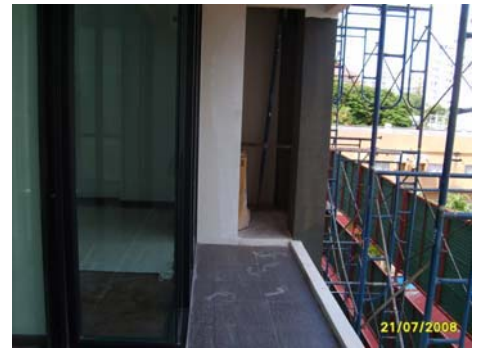
Pict No.78 : Balcony View