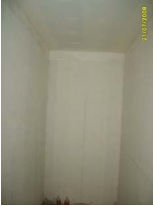
Pict No.145 : Wall tiling works