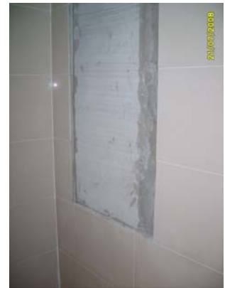
Pict No.18 : Tiling works in 1st Toilet