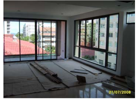
Pict No.75 : Living area general view