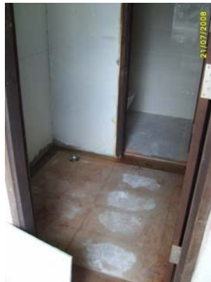
Pict No.143 : Sand stone works