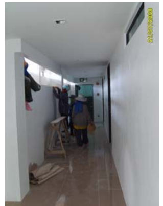
Pict No.72 : Corridor General view