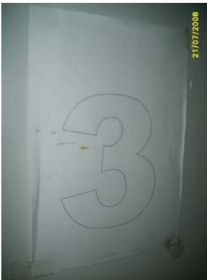
Pict No.163 : 3rd floor