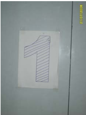
Pict No.04 : 1st Floor