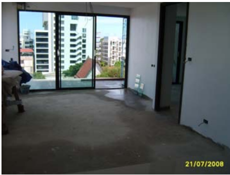
Pict No.136 : Surface preparation for Tiling works