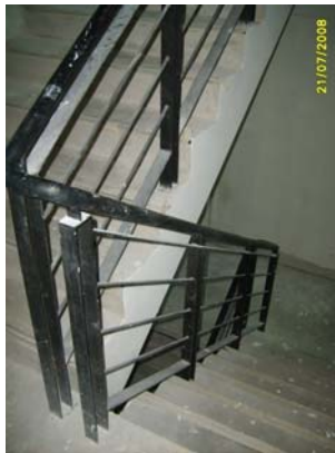
Pict No.164 : Handrailing to 2nd floor