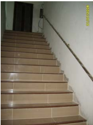
Pict No.103 : Stair to 7th Floor