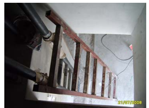
Pict No.168 : Ladder to 1st floor