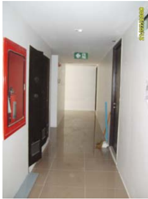
Pict No.30 : Corridor general view