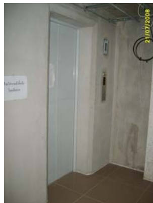
Pict No.23 : 1st Floor in front of elevator