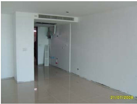
Pict No.100 : Studio Unit general view