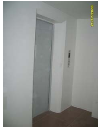
Pict No.45 : 3rd Floor infront of elevator