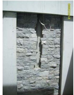
Pict No.141 : Natural stone decoration