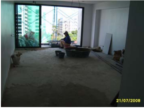
Pict No.133 : Surface preparation for Tiling works