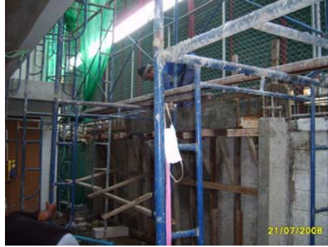
Pict No.14 : Wall decoration behind project