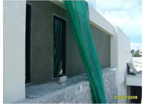
Pict No.147 : Kenzai decoration