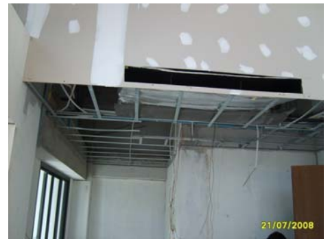
Pict No.108 : Ceiling frame and plastering