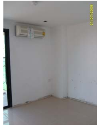
Pict No.102 : Master bedroom general view