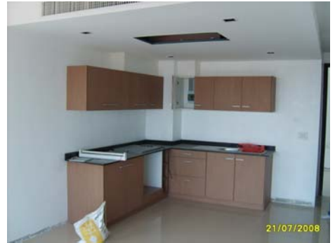
Pict No.93 : Kitchen area