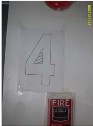
Pict No.161 : 4th floor