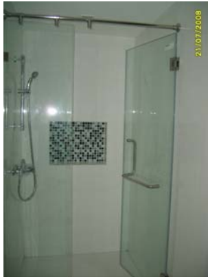
Pict No.53 : Shower screen