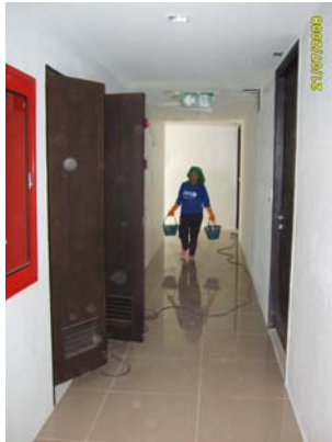
Pict No.68 : Corridor General view