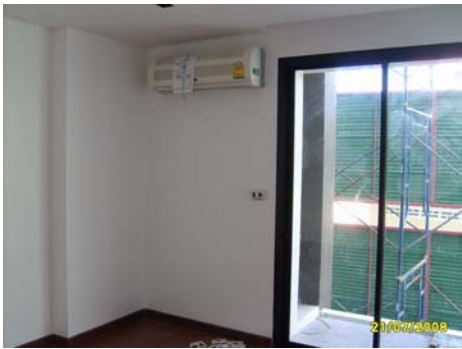
Pict No.64 : Master bedroom general view