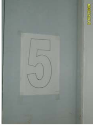
Pict No.74 : 5th Floor