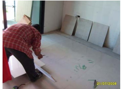
Pict No.117 : Floor tiling works