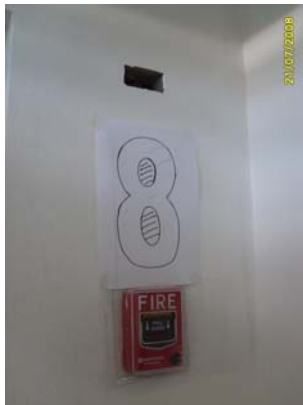
Pict No.152 : 8th Floor Fire exit area