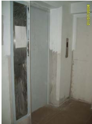
Pict No.125 : 8th Floor in front of elevator