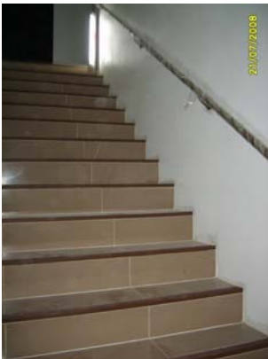
Pict No.43 : Stair to 3rd Floor