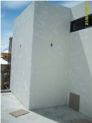
Pict No.148 : Surface preparation