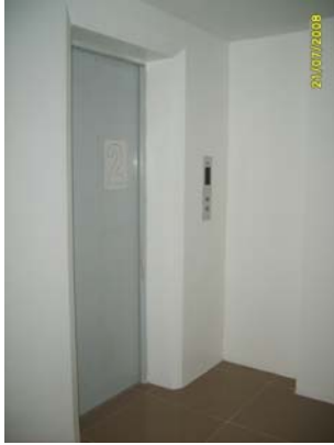
Pict No.26 : 2nd Floor infront of elevator