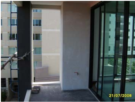
Pict No.79 : Balcony View