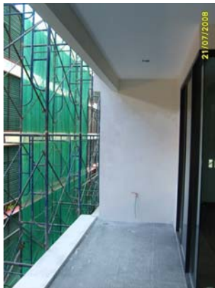
Pict No.59 : Balcony view