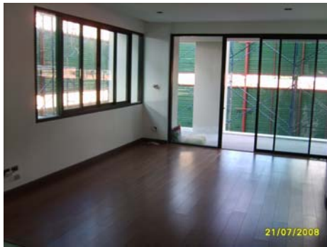
Pict No.56 : Living area general view