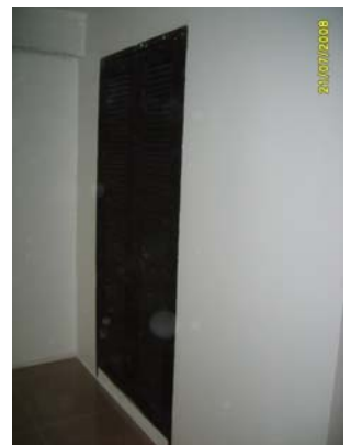
Pict No.48 : Water pipe shaft door