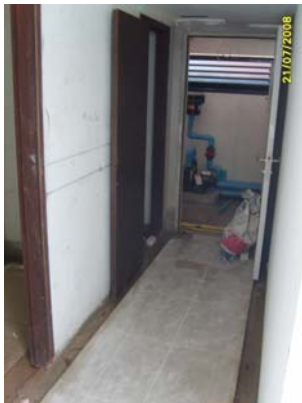
Pict No.142 : Sand stone works