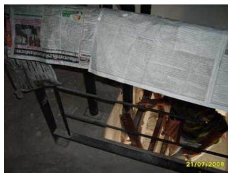
Pict No.167 : Hand railing to 1st floor