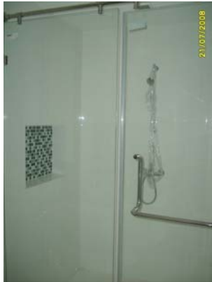
Pict No.65 : Shower screen