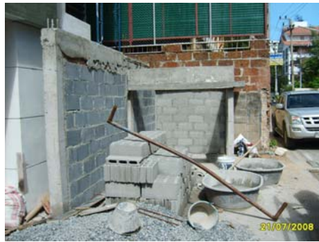
Pict No.05 : Garbage Area