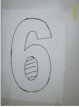
Pict No.157 : 6th Floor