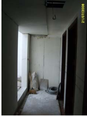
Pict No.146 : Sand stone works