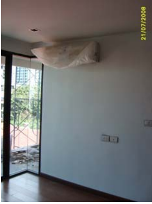
Pict No.97 : Master bedroom general view