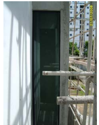
Pict No.42 : WG1 Fixed windows beside Janitor room