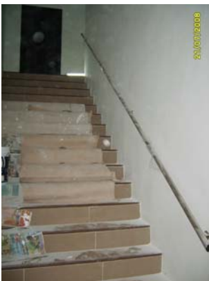
Pict No.46 : Stair to 4th Floor