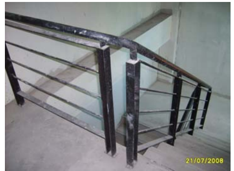
Pict No.153 : Handrailing to 7th Floor