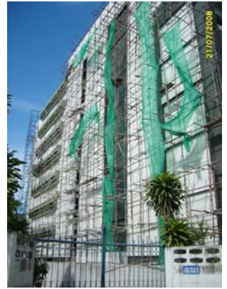
Pict No.03 : Side View