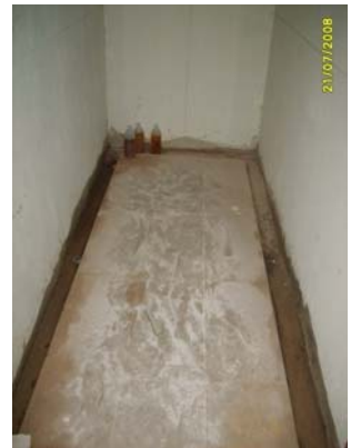
Pict No.144 : Sand stone works