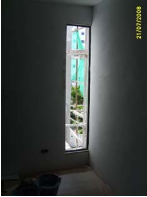
Pict No.85 : WG1 Fixed windows beside Janitor room