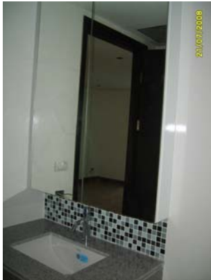
Pict No.52 : Cabinet above Water sink