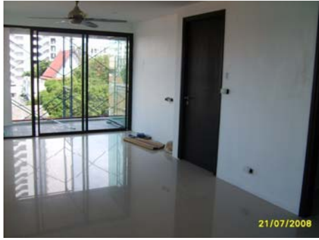
Pict No.86 : Living area general view