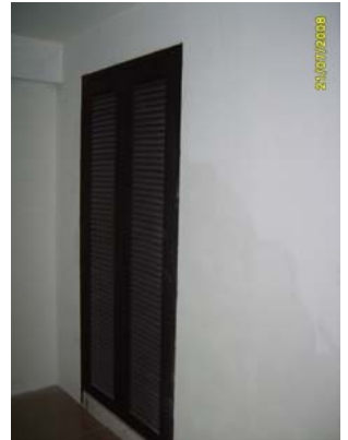
Pict No.69 : Water pipe shaft door