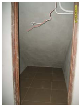
Pict No.20 : Storage room under staircase