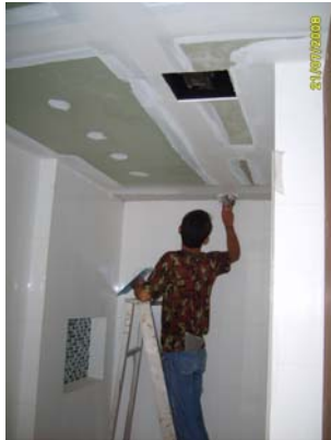
Pict No.113 : Ceiling plastering works