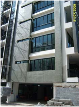
Pict No.01 : Front View