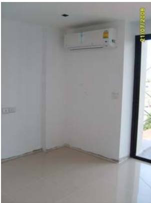
Pict No.94 : Master bedroom general view