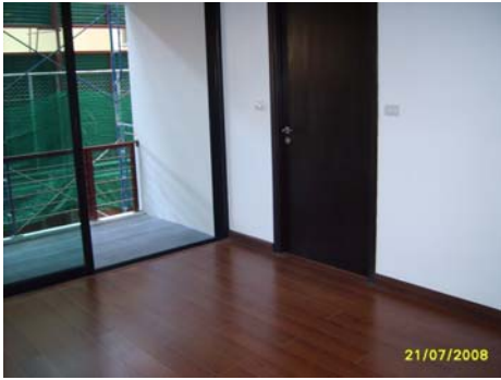
Pict No.32 : Living area