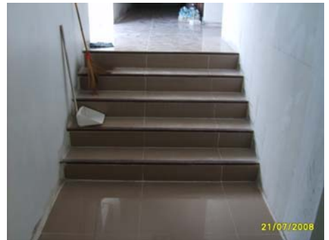
Pict No.129 : General view of stair