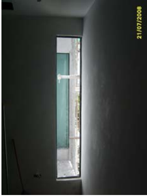
Pict No.73 : WG1 Fixed windows beside Janitor room