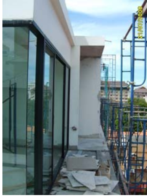
Pict No.110 : Balcony view