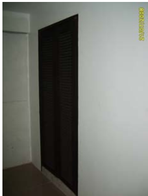
Pict No.83 : Water pipe shaft door