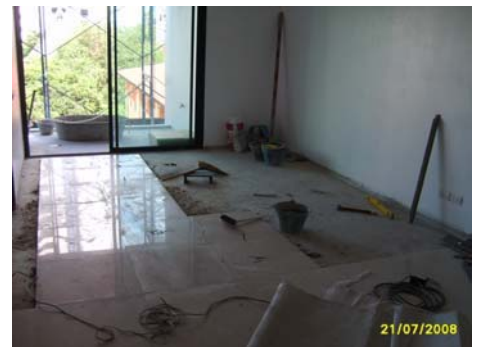
Pict No.84 : Floor tiling works