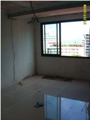
Pict No.112 : Floor tiling works