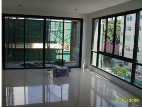
Pict No.62 : Living area general view