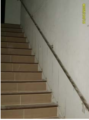
Pict No.61 : Stair to 5th Floor