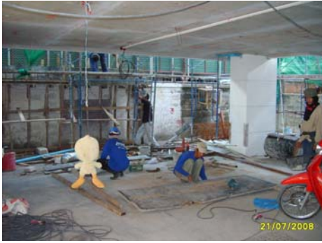
Pict No.13 : General view