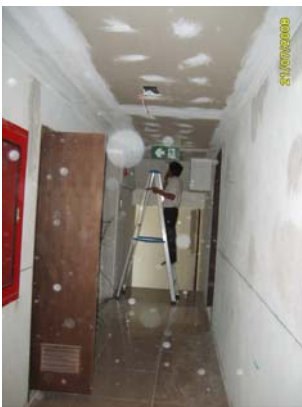
Pict No.106 : Corridor general view