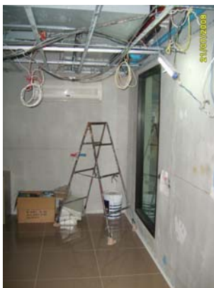
Pict No.19 : 1st Office view