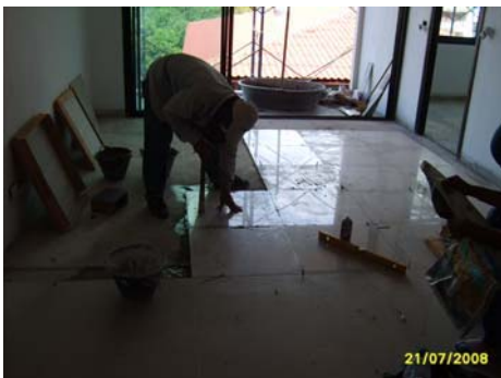
Pict No.82 : Floor tiling works