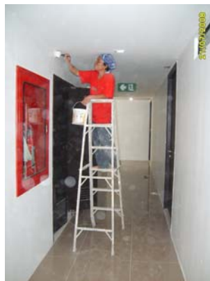
Pict No.47 : Corridor general view