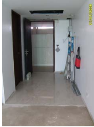
Pict No.134 : General view