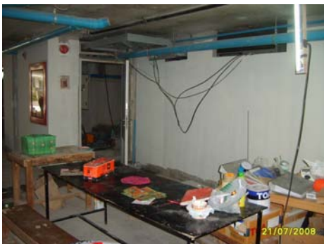
Pict No.10 : General view