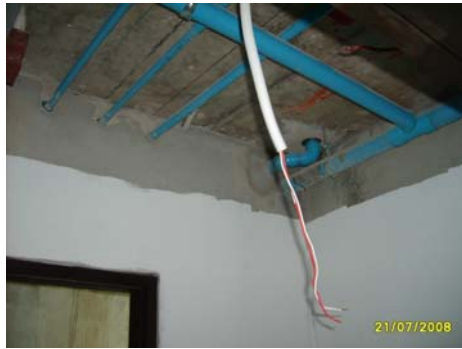
Pict No.36 : Piping works above janitor room