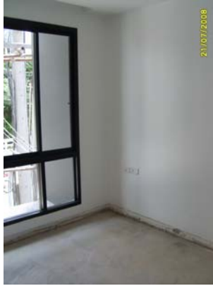
Pict No.27 : Surface preparation works for Unit 201