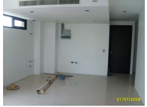
Pict No.63 :