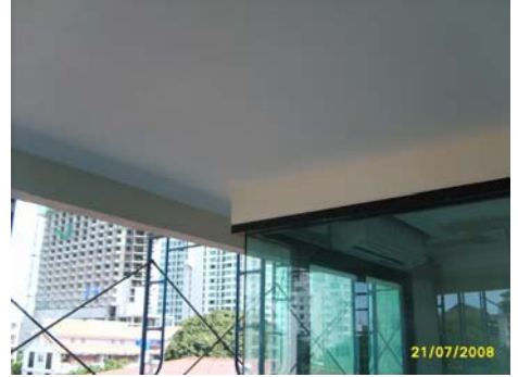
Pict No.87 : Balcony Ceiling works