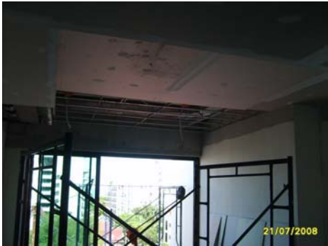
Pict No.115 : Ceiling plastering works