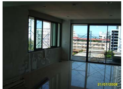
Pict No.120 : Living area