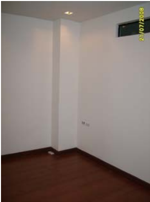
Pict No.31 : 2nd Bedroom General view