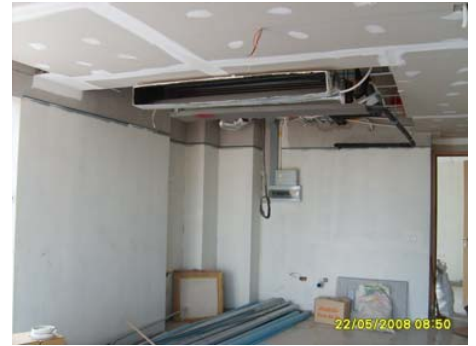
Pict 74 : Ceiling works and Air condition works