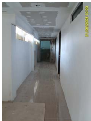
Pict 32 : Tiling work at Corridor