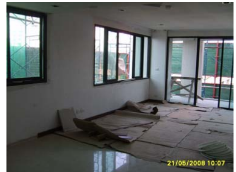
Pict 44 : Laminated Flooring