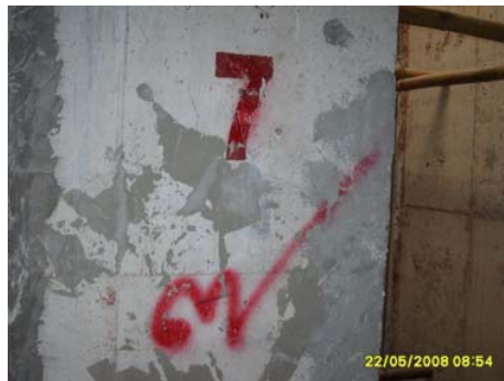
Pict 91 : 7th Floor