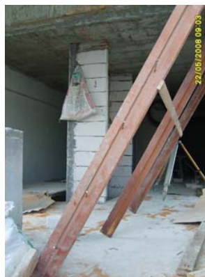
Pict 127 : Brick works