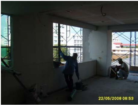
Pict 87 : Primary painting works