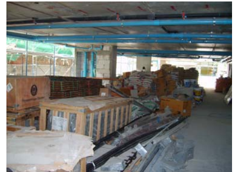
Pict 06 : Stock yard area