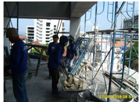
Pict 92 : Plastering and other works