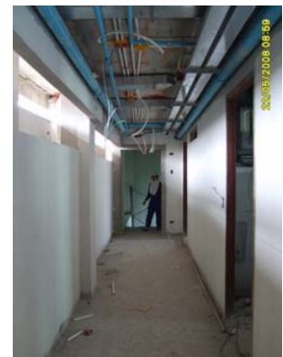
Pict 107 : Corridor general view