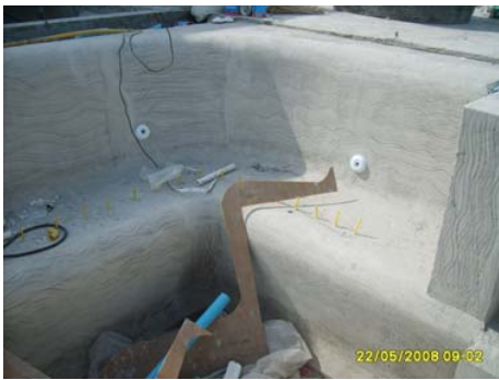
Pict 123 : Jacuzzi Bench works