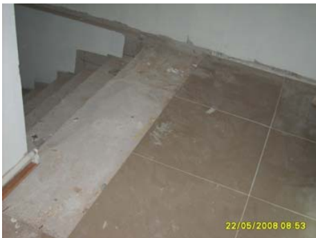
Pict 90 : Flooring works of stair down to 5th Floor