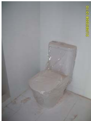
Pict 58 : Sanitary ware and protection