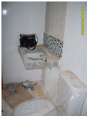
Pict 102 : Tiling works in Toilet