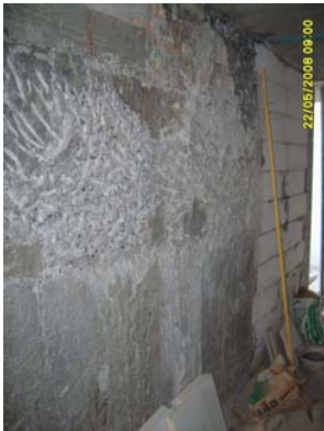
Pict 114 : Wall plastering works