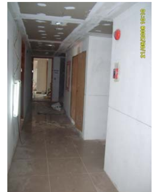
Pict 59 : Corridor view