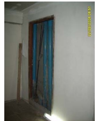
Pict 80 : M&E Piping works