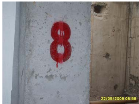
Pict 103 : 8th Floor