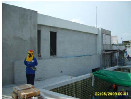
Pict 118 : General of view