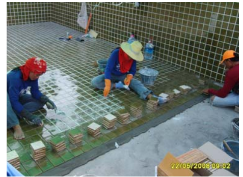
Pict 122 : Swimming pool tiling works