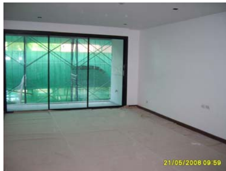
Pict 23 : Laminated flooring