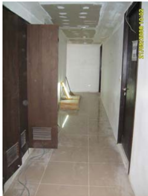
Pict 29 : Corridor Tiling works