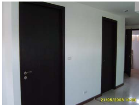
Pict 35 : Wooden door final painting