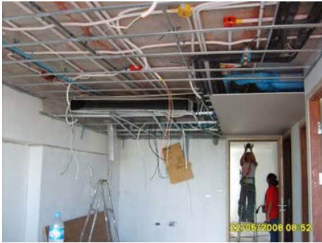
Pict 84 : Ceiling frame and electric wiring