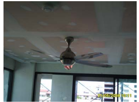
Pict 62 : Ceiling fan installation