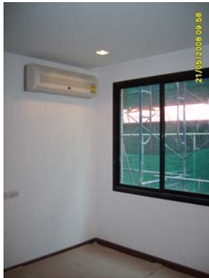
Pict 16 : Air Condition and electricity testing