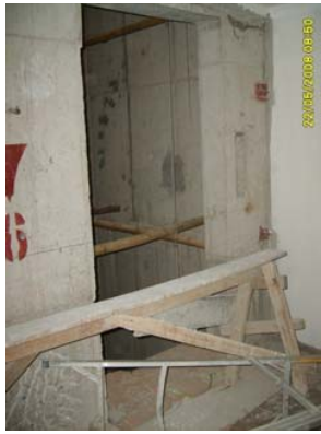
Pict 73 : Elevator 6th Floor