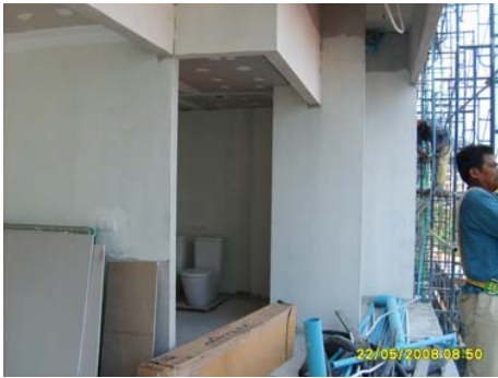
Pict 75 : Primary paint