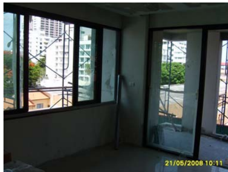
Pict 67 : Aluminium door frame installation