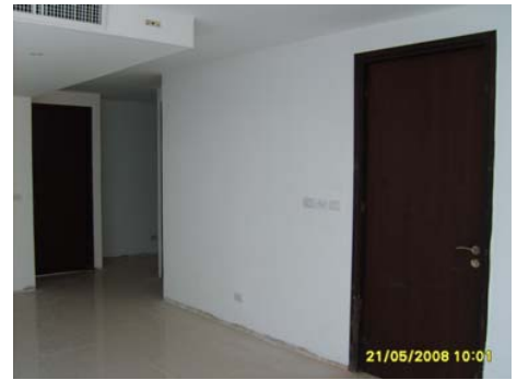
Pict 27 : Secondary paint