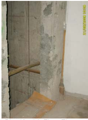
Pict 49 : 5th Floor Elevator