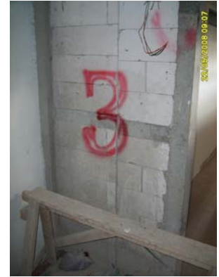
Pict 137 : Fire exit stair case 3rd Floor