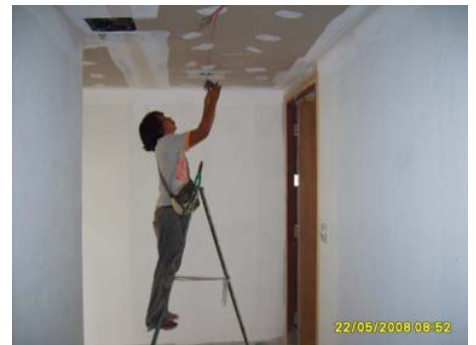
Pict 83 : Electrical works