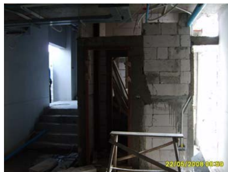
Pict 106 : Brick works and plastering works