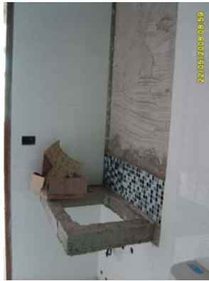
Pict 109 : Tiling works in toilet