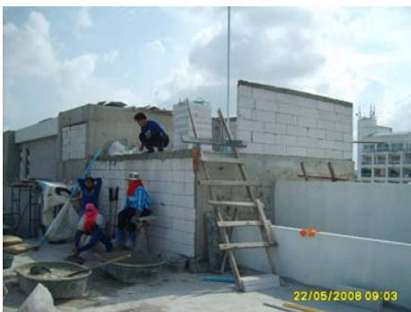
Pict 126 : General view