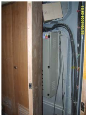
Pict 79 : Shaft door installation