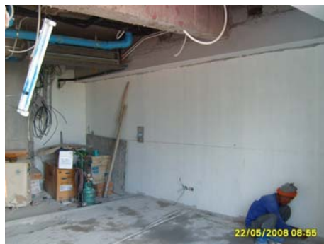
Pict 94 : Primary paint and piping works