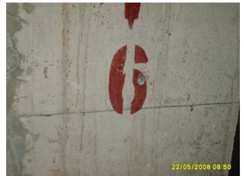
Pict 71 : 6th Floor