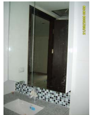
Pict 21 : Toilet cabinet and accessories