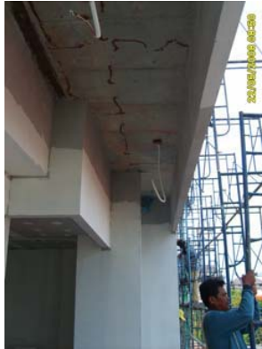
Pict 76 : Wiring work