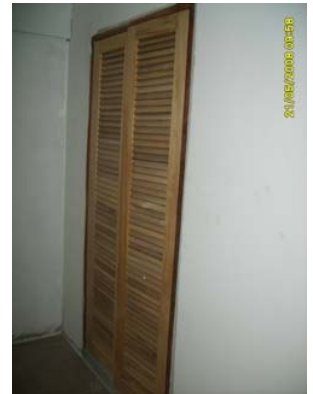
Pict 18 : M&E Door installation