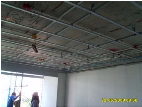
Pict 99 : Ceiling frame works