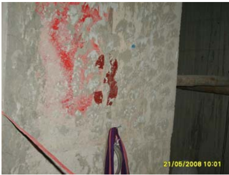
Pict 25 : 3rd Floor