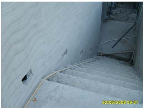
Pict 117 : Blockout for stair lamp to 8th floor