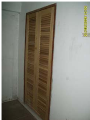
Pict 31 : M&E Door installation