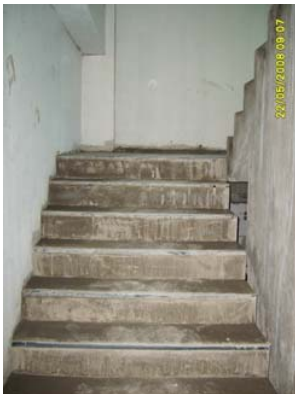
Pict 141 : Fire exit stair case 2nd to 3rd FI