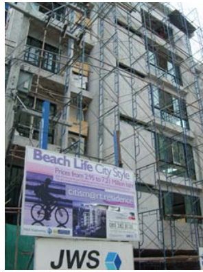
Pict 02 : Front View