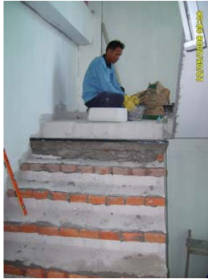
Pict 136 : Fire exit stair case 4th to 5th FI