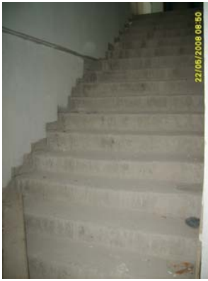
Pict 72 : Stair to 7th Floor