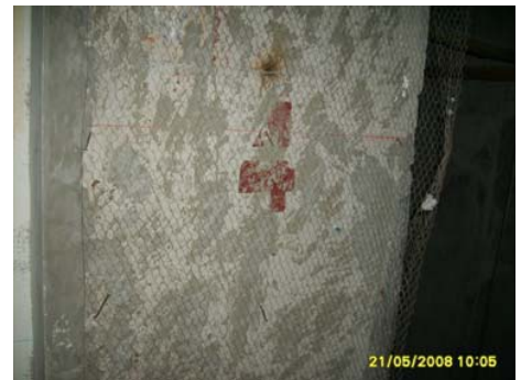
Pict 36 : 4th Floor