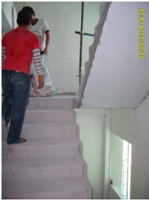
Pict 132 : Fire exit stair case 5th to 6th FI