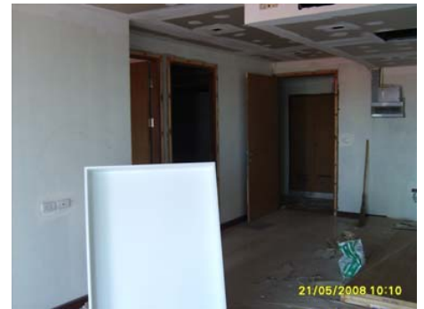
Pict 56 : Door installation