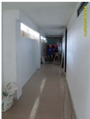
Pict 22 : Corridor Tiling works