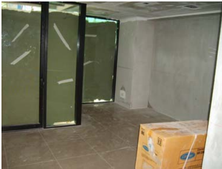
Pict 04 : Lift Lobby , Tiling works and Aluminium frame