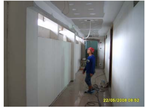
Pict 86 : Corridor Tiling works