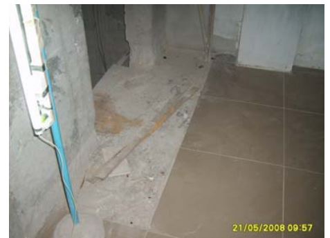
Pict 12 : Tiling works infront of Elevator