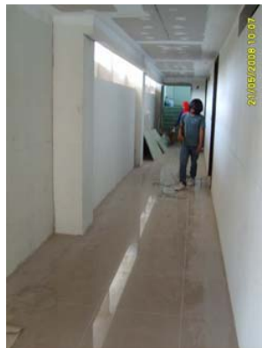
Pict 43 : Corridor Tiling works