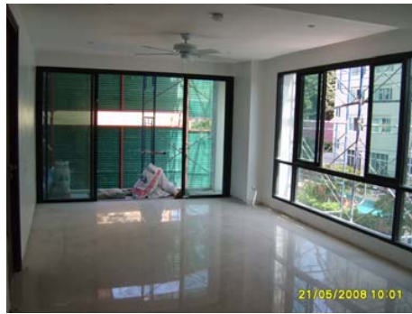
Pict 26 : Unit 301 , Tiling works