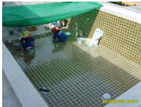
Pict 115 : Swiming pool and pool deck