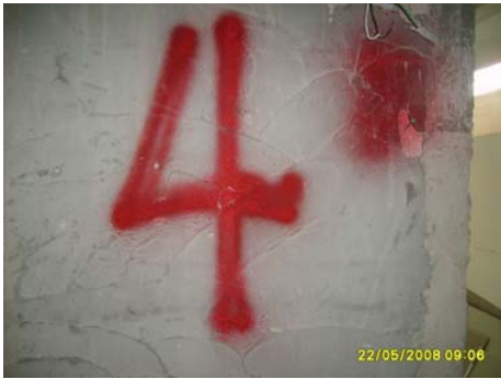
Pict 135 : Fire exit stair case 4th Floor