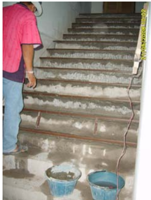
Pict 28 : Stair finishing to 4th Floor