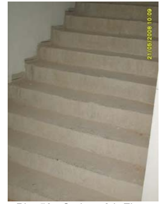
Pict 50 : Stair to 6th Floor