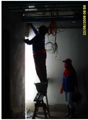
Pict 97 : Plastering work above ceiling works