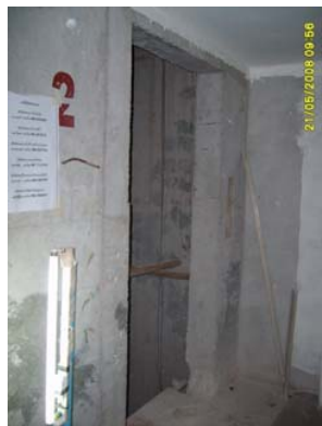
Pict 11 : 2nd FL Elevator