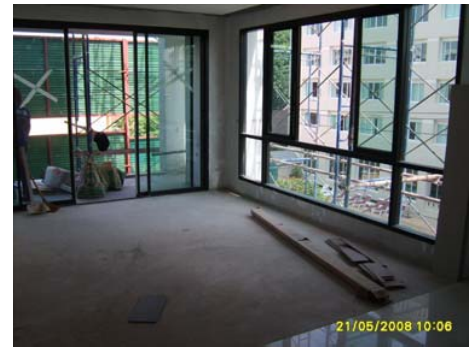
Pict 38 : Laminated flooring