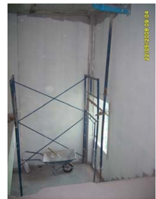
Pict 128 : Primary paint around stair