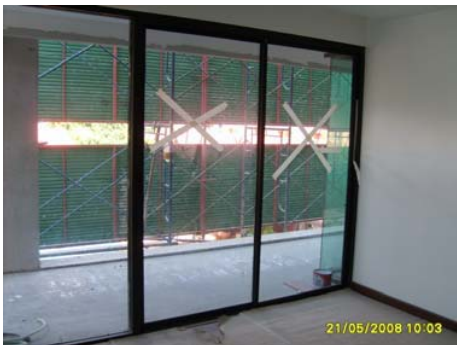
Pict 34 : Aluminium Door and Windows