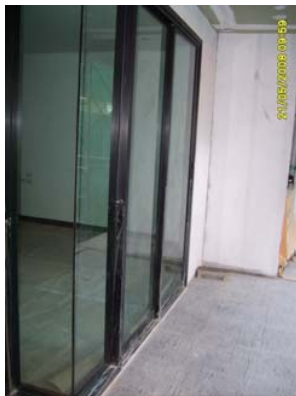
Pict 20 : Terrace View