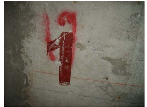
Pict 03 : 1st Floor