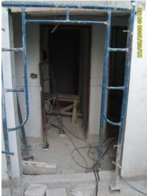
Pict 111 : Wooden door frame and primary paint