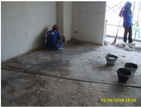
Pict 96 : Surface preparation for flooring works