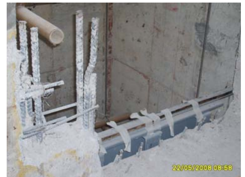
Pict 104 : Elevator preparation work