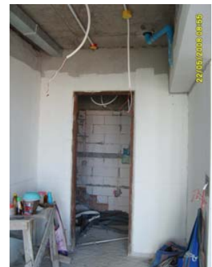
Pict 95 : Door frame and brick works