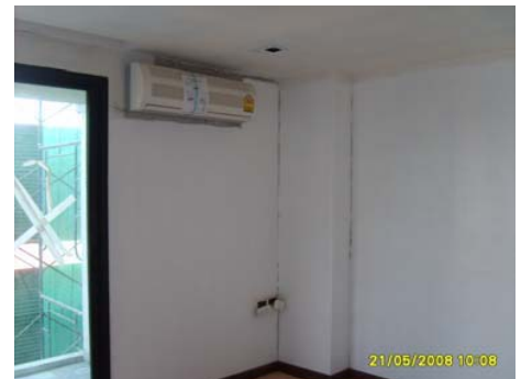
Pict 47 : Air Condition system