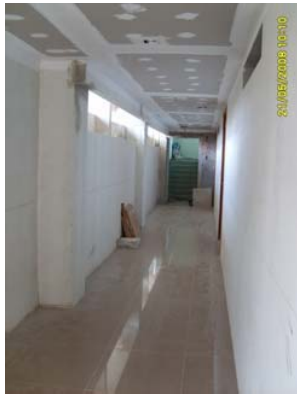
Pict 60 : Corridor view