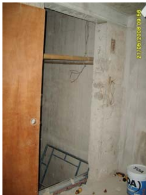
Pict 07 : 1st FL Elevator