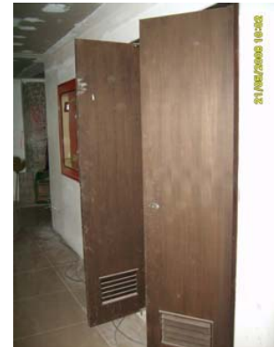
Pict 30 : Shaft Door painting