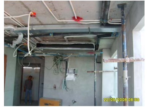
Pict 110 : Air condition installtion