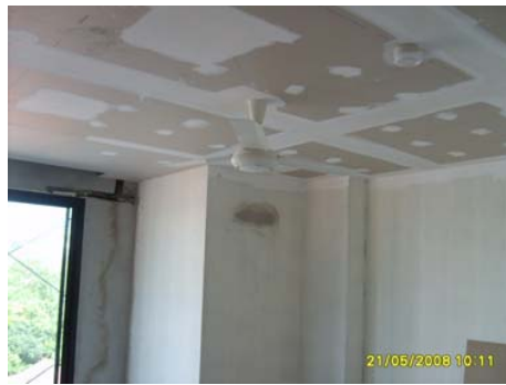
Pict 64 : Ceiling works and Fans