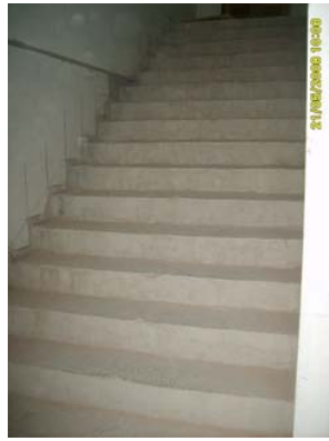
Pict 37 : Stair to 4th Floor