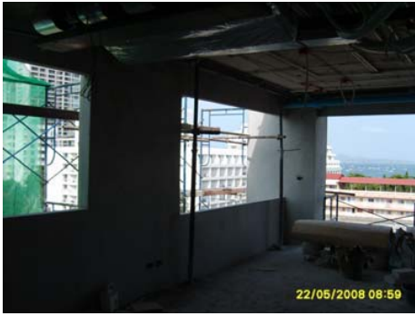
Pict 108 : Primary painting