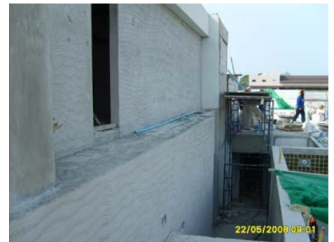
Pict 116 : General view and skeeding surface preparation