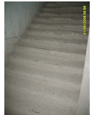
Pict 09 : Stair to 2nd Floor