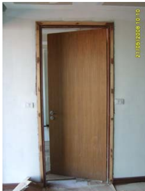
Pict 57 : Door and door frame installation