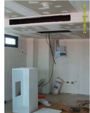
Pict 53 : Air Condition system