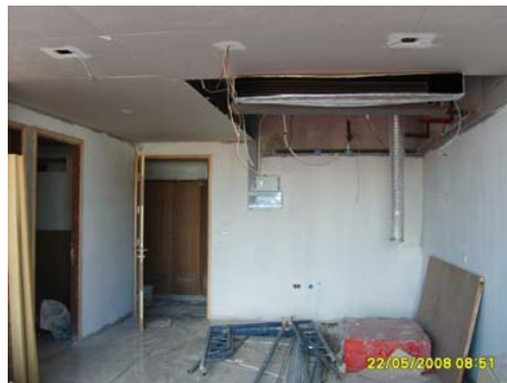
Pict 82 : Ceiling works and Air condition