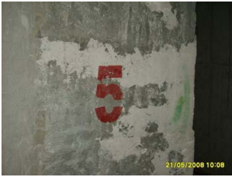
Pict 48 : 5th Floor