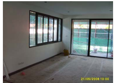
Pict 24 : Laminated Flooring