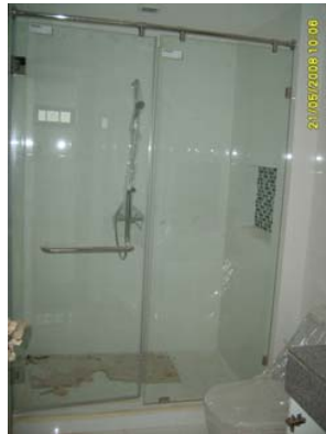
Pict 40 : Shower screen installation