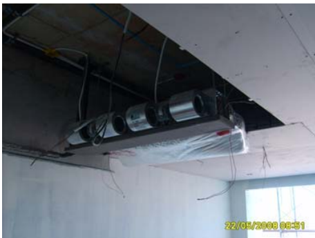
Pict 81 : Ceiling works and Air condition