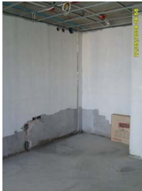
Pict 100 : Primary painting