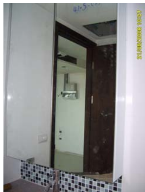
Pict 46 : Toilet Cabinet