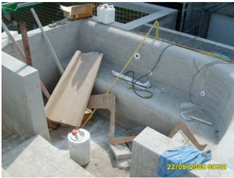
Pict 120 : Jacuzzi Bench works