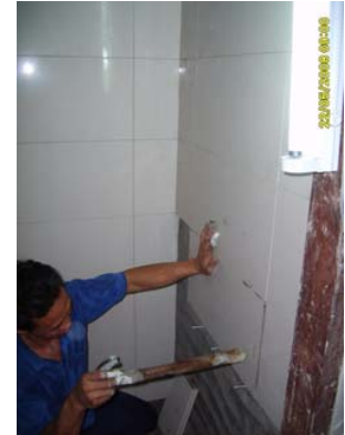
Pict 113 : Wall Tiling works