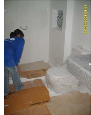
Pict 77 : Sanitary installation