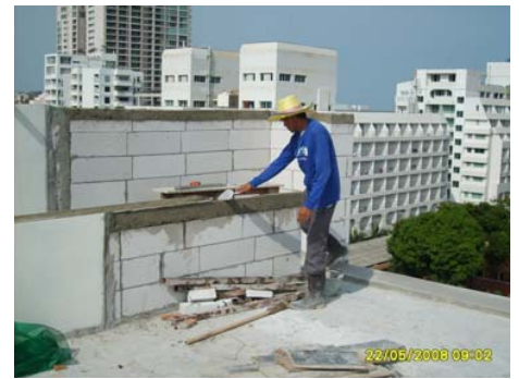
Pict 125 : Plastering works