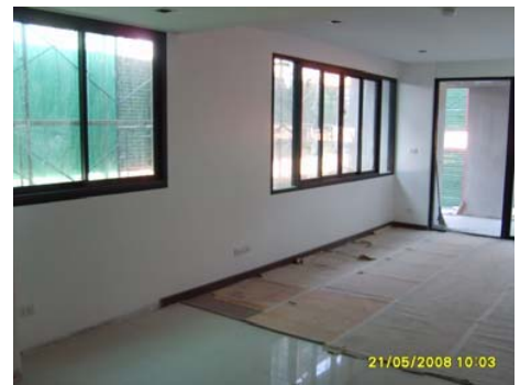
Pict 33 : Laminated flooring