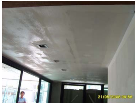
Pict 08 : Ceiling Paint above Lift lobby