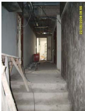
Pict 93 : Stair to 7th floor unit