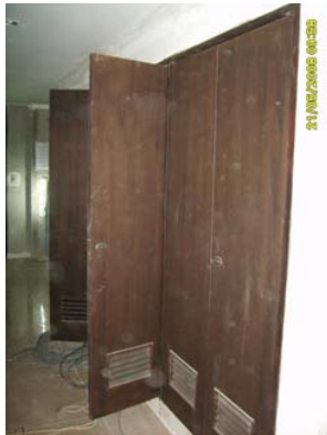
Pict 17 : Shaft door painting works