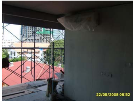
Pict 85 : Air condition installtion