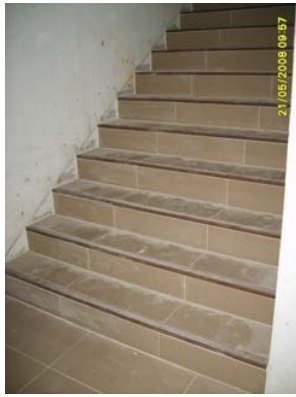
Pict 14 : Stair to 3rd Floor