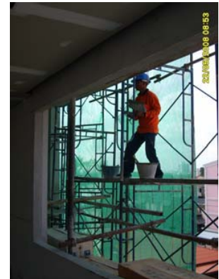
Pict 89 : External Plastering works