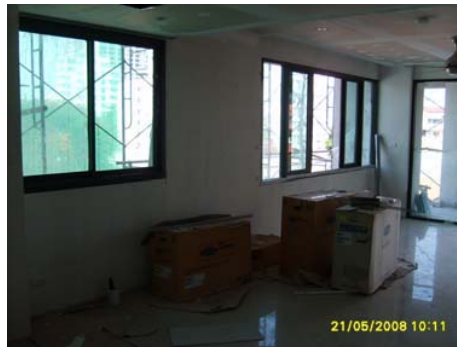
Pict 61 : Tiling works and general view