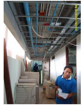
Pict 98 : Ceiling frame and piping works