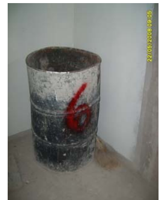
Pict 131 : Fire exit stair case 6th Floor