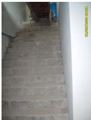
Pict 105 : Stair to Swiming pool area