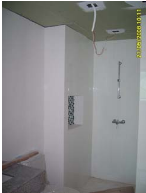
Pict 63 : Ceiling works above toilet