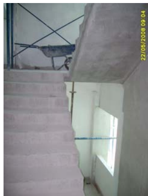
Pict 130 : Fire exit stair case 6th to 7th Fl