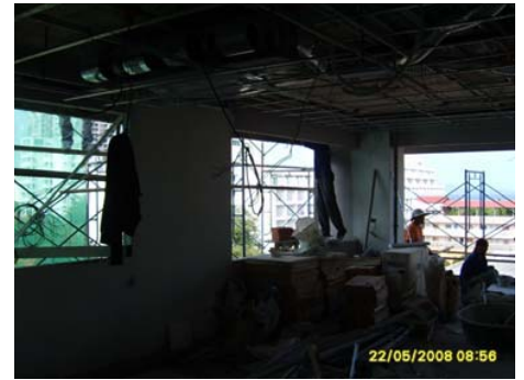
Pict 101 : Air condtion system and ceiling frame