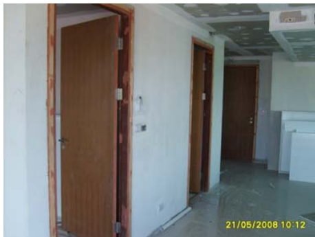
Pict 69 : Door installation