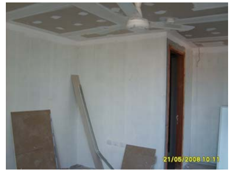
Pict 65 : Ceiling works and Fans