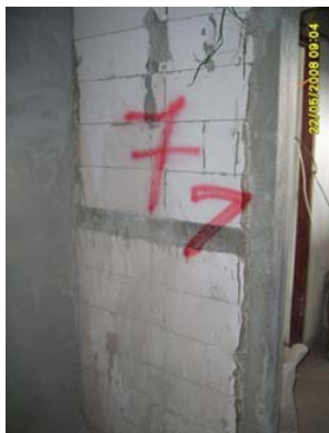
Pict 129 : Fire exit stair case 7th Floor