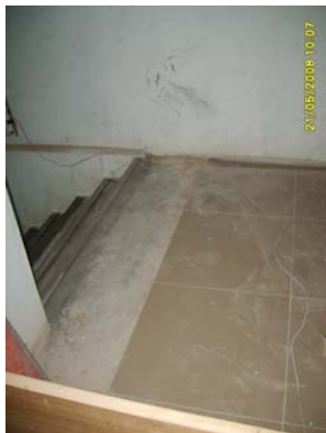
Pict 42 : Stair Finishing to 3rd Floor