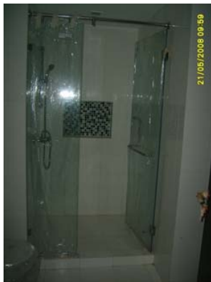
Pict 19 : Shower screen view