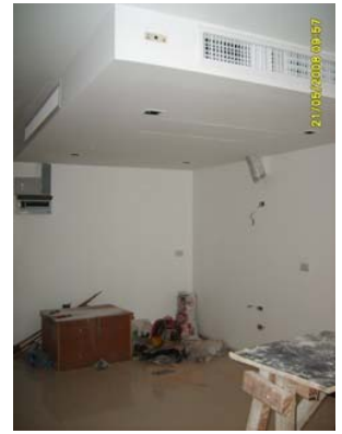
Pict 15 : Ceiling painting and tiling works