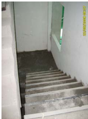
Pict 139 : Fire exit stair case 3rd to 2nd FI