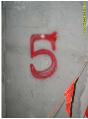
Pict 133 : Fire exit stair case 5th Floor