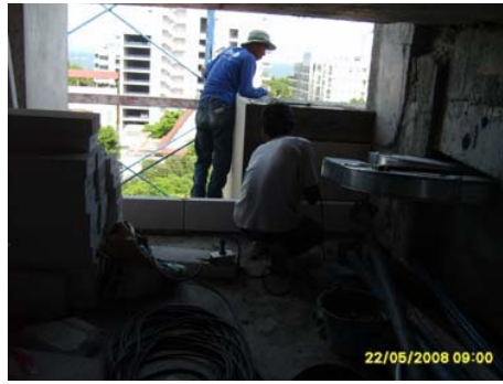
Pict 112 : Brick and plastering works