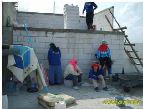
Pict 124 : Light weight brick works and plastering