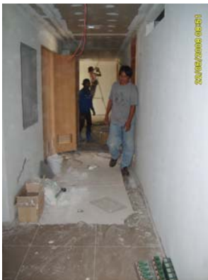
Pict 78 : Corridor tiling works