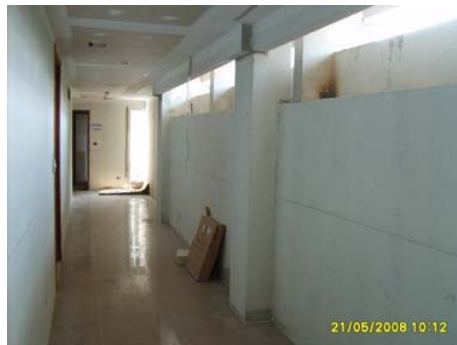
Pict 70 : Corridor Tiling works