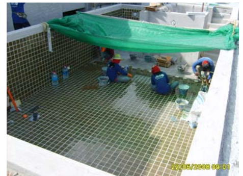
Pict 119 : Swiming pool tiling works