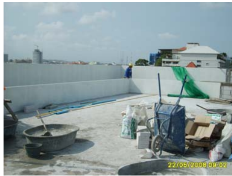
Pict 121 : Planter box and primary paint