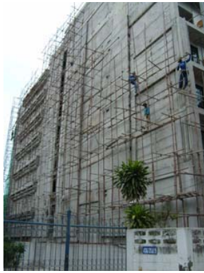
Pict 01 : Side View