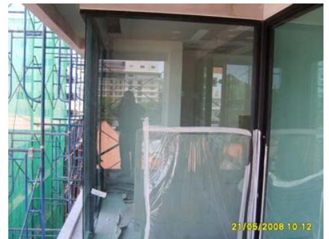
Pict 68 : Aluminium door frame installation