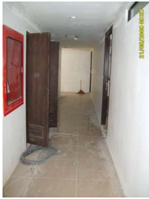
Pict 13 : Corridor view