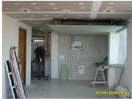
Pict 88 : Ceiling works and primary paint