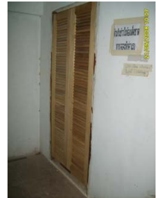
Pict 41 : M&E Door installation