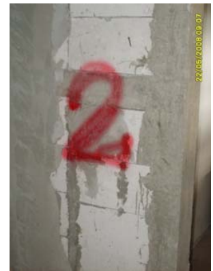
Pict 140 : Fire exit stair case 2nd Floor