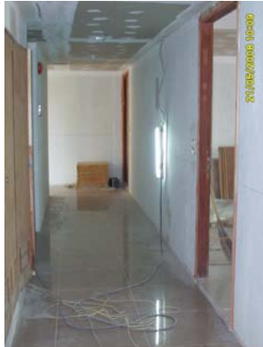
Pict 51 : Corridor Tiling works