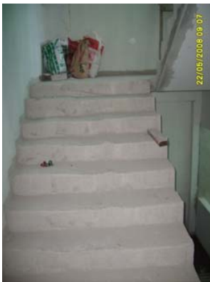
Pict 138 : Fire exit stair case 3rd to 4th FI