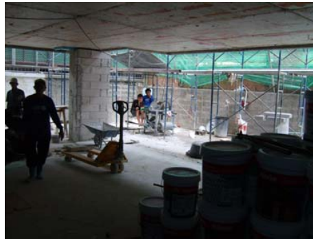
Pict 05 : Stock yard area