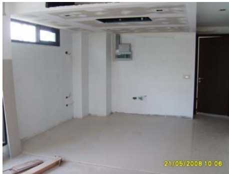
Pict 39 : Kitchen and 2nd painting