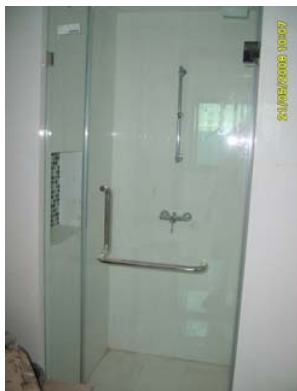
Pict 45 : Shower Screen