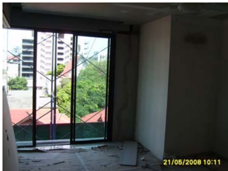
Pict 66 : Aluminium door frame installation