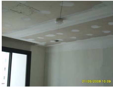
Pict 52 : Ceiling works