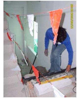
Pict 134 : Fire exit stair case 5th to 4th FI