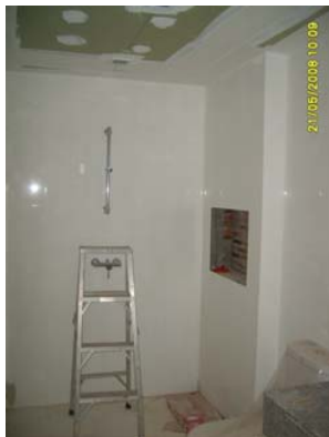
Pict 54 : Ceiling above toilet