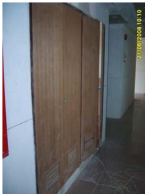
Pict 55 : Shaft door installation